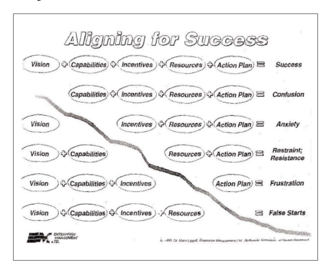
Diagram 1B: Lippitt's "Aligning for Success"

changing parlance in her field; (4) she changed the title of the diagram; and (5) added a decorative diagonal line.