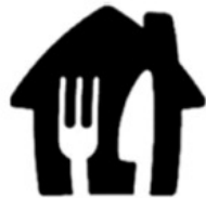
JET House Mark

Mark” with local brand names when conducting business in various countries. JET has used the JET House Mark in connection with its business since 2014.