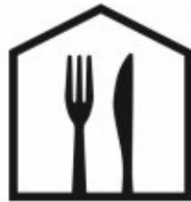
HC Home Mark

name (the “Home Chef Home Logo”). None of Home Chef’s marks are limited as to color.