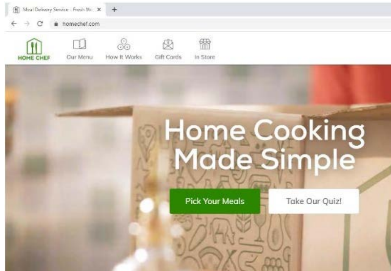
Home Chef Website

None of the images used in the survey exhibited the Home Chef Home Logo or the HC Home Mark in isolation without