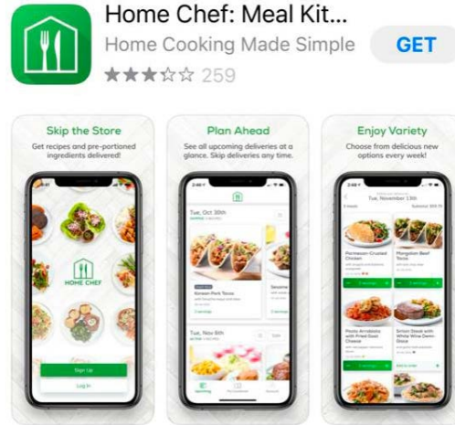
Home Chef Mobile App