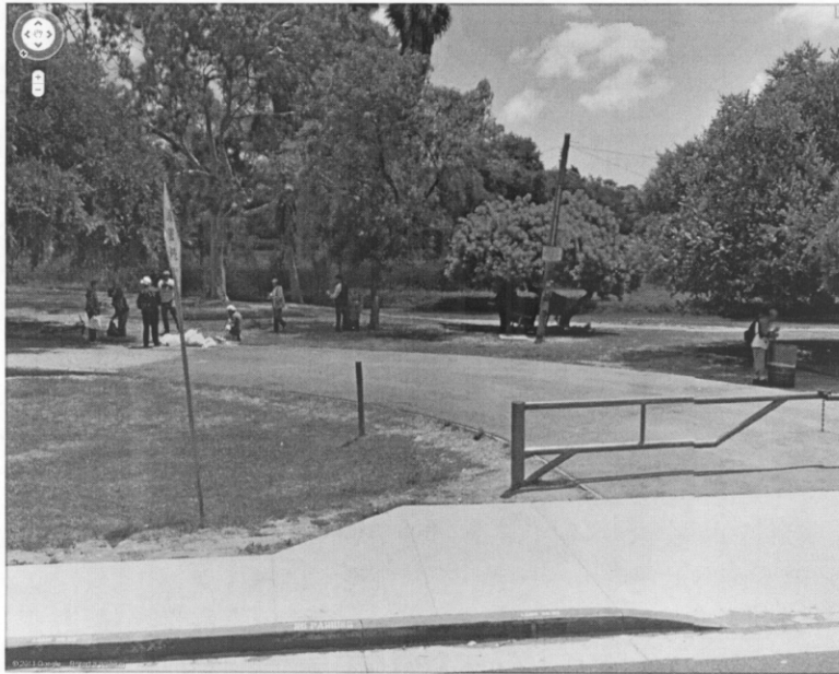
South Vermont Avenue just south of Pacific Coast Highway, San Pedro, California, approximately six miles from Redondo Beach. Image downloaded July 15, 2011, 11:59 PM, from http://maps.google.com/maps?q=San+Pedro,+Los+Angeles,+CA&hl=en&ll=33.78937,-118.293459&spn=0.000275,0.000603&sl=37.0625,-95.677068&sspn=41.818029,107.138672&t=h&layer=c&cbll=33.78937,-118.293459&panoid=z9GFs0Be6EDXLYiT1P8B5Q&cbp=13,141.88,,1.4.68&z=2