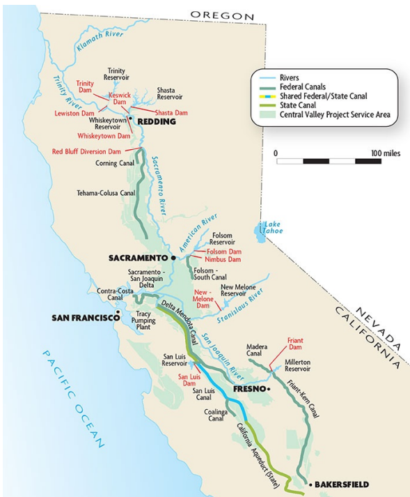
Fig. B. CVP and SWP Map. 5

The Projects also control the volume of water flowing through the Central Valley's rivers by prescribing releases from upstream reservoirs, which operate as water storage facilities. Releases from CVP/SWP reservoirs cool water temperatures, reduce the salinity of the Delta, provide flood control, improve volume for fish habitat and migration, and supply additional water for agricultural use. See OCAP BA at 2-5.