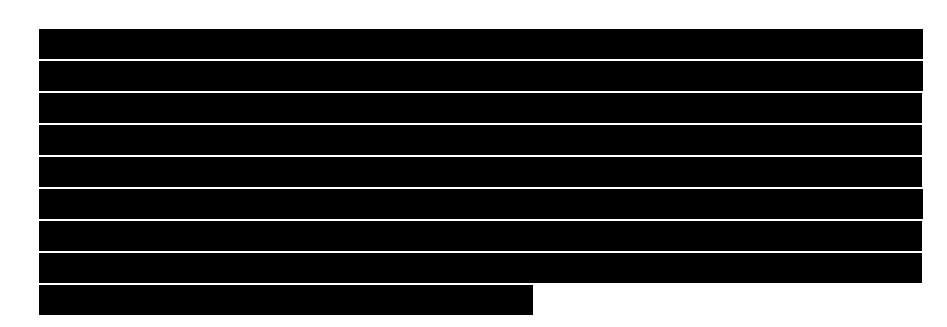
Id. § 1.5 (emphasis in original).