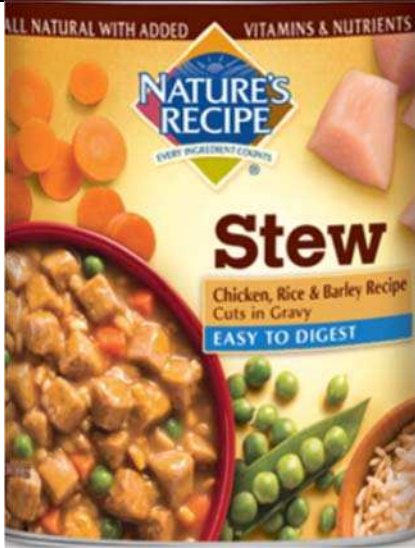
Nature's Recipe Easy to Digest Chicken Rice & Barley Recipe Cuts in Gravy ( Wysong Corp. v. Big Heart Pet Brands et al. , Civil Action No. 16-11823, ECF #1-3 at Pg. ID 64.)