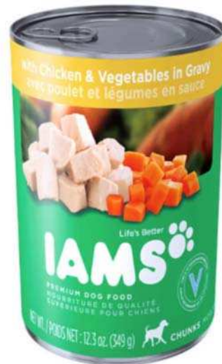
Iams Adult Chunks with Chicken and Vegetables in Gravy (Wysong Corp. v. Mars Petcare Co., Civil Action No. 16-11826, ECF #1-3 at Pg. ID 74; ECF #14-2 at Pg. ID 298.)