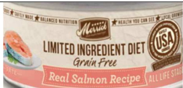
Limited Ingredient Diet Real Salmon Recipe ( Wysong Corp. v. Nestle Purina Petcare Company , Civil Action No. 16-11827, ECF #1-2 at Pg. ID 48; ECF #16-3 at Pg. ID 248.)