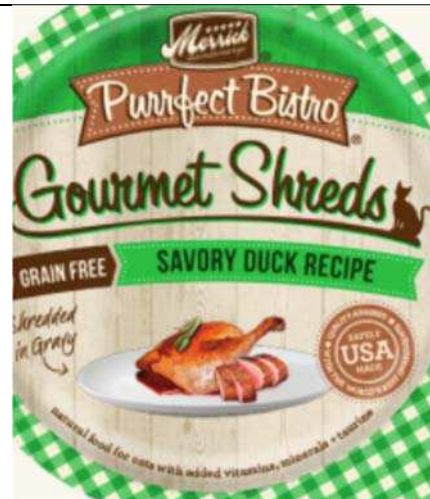
Purrfect Bistro Savory Duck Recipe Shredded in Gravy ( Wysong Corp. v. Nestle Purina Petcare Company , Civil Action No. 16-11827, ECF #1-2 at Pg. ID 41; ECF #16-3 at Pg. ID 245.)