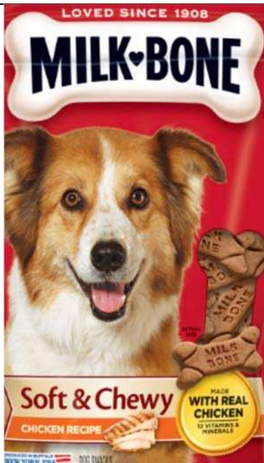
Milk Bone Soft & Chewy Chicken Recipe (Wysong Corp. v. Big Heart Pet Brands et al., Civil Action No. 16-11823, ECF #1-3 at Pg. ID 57.)