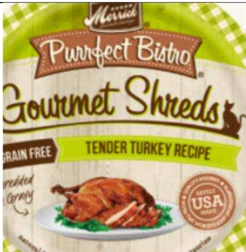
Purrfect Bistro Turkey Recipe Shredded in Gravy ( Wysong Corp. v. Nestle Purina Petcare Company , Civil Action No. 16-11827, ECF #1-2 at Pg. ID 42.)