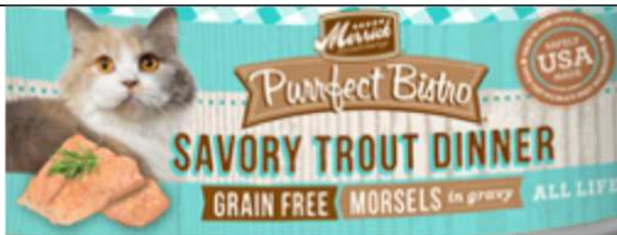
Purrfect Bistro Savory Trout Dinner Morsels in Gravy ( Wysong Corp. v. Nestle Purina Petcare Company , Civil Action No. 16-11827, ECF #1-2 at Pg. ID 45.)