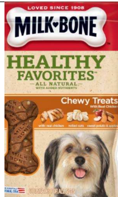
Healthy Favorites Chewy Treats with Real Chicken (Wysong Corp. v. Big Heart Pet Brands et al., Civil Action No. 16-11823, ECF #1-3 at Pg. ID 58; ECF #16-2 at Pg. ID 143.)