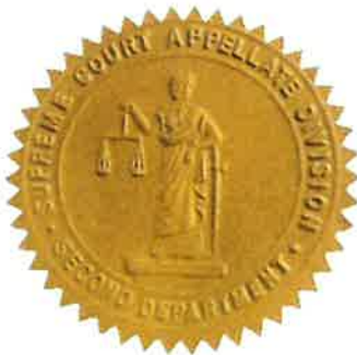
Acting Clerk of the Court

In Witness Whereof, I have hereunto set my hand in the City of Brooklyn on December 27, 2023.