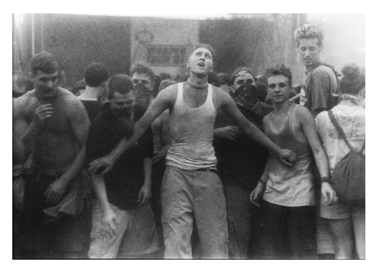
(Cmplt. (Dkt. No. 3) Ex. A)