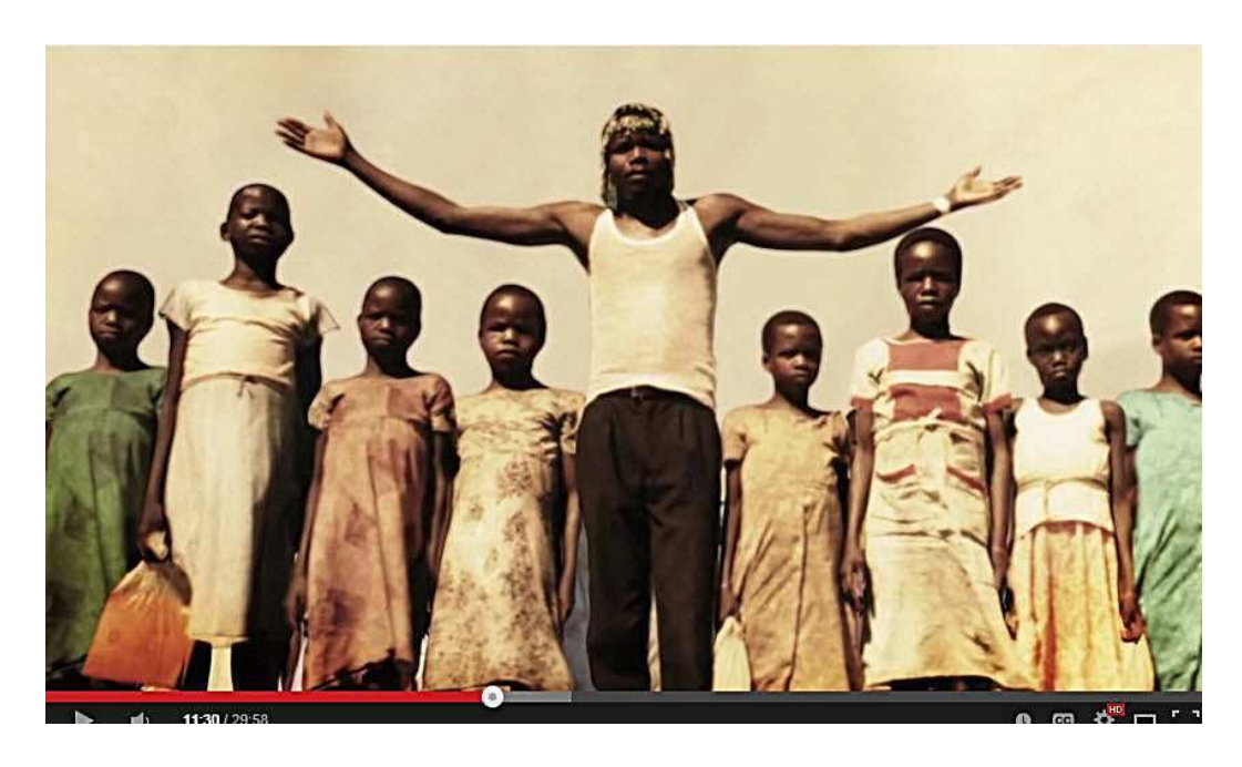
(Cmplt. (Dkt. No. 3) Ex. B)

Russell then says, "It's been over 30,000 of them," and other allegedly infringing images are shown, showing Kony with thousands of children he has kidnapped: