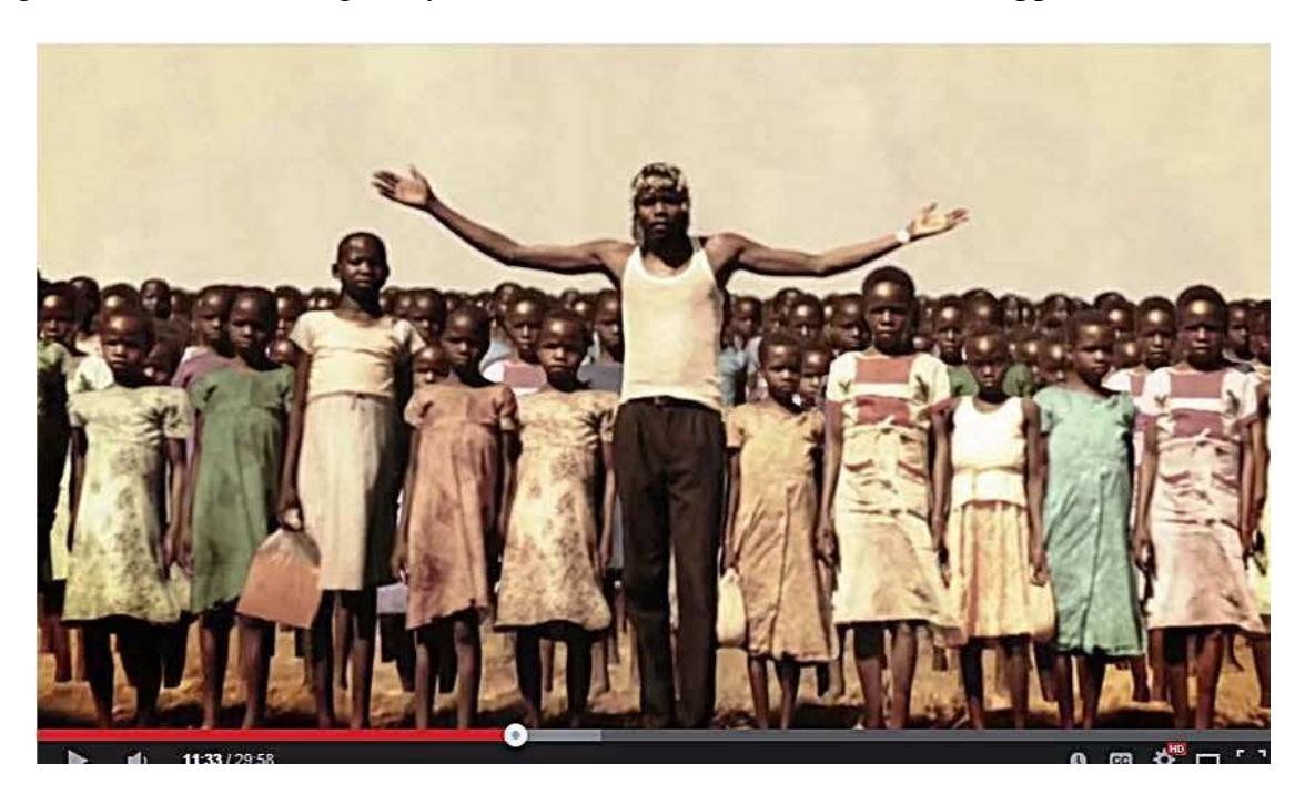
(Cmplt (Dkt. No. 3) Ex. B (one of the allegedly infringing images))

Russell then says, "It's been over 30,000 of them," and other allegedly infringing images are shown, showing Kony with thousands of children he has kidnapped: