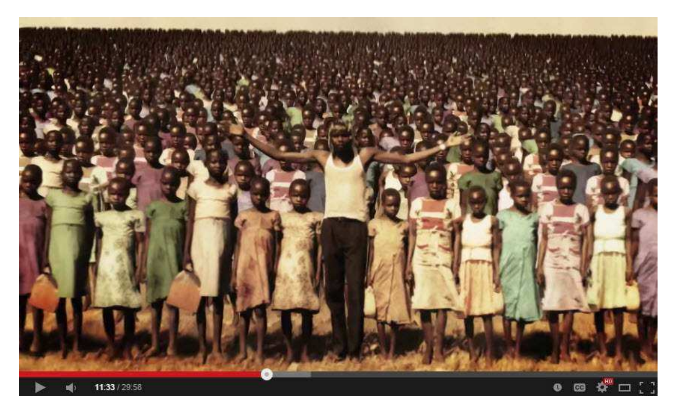
(Cmplt. (Dkt. No. 3) Ex. B)