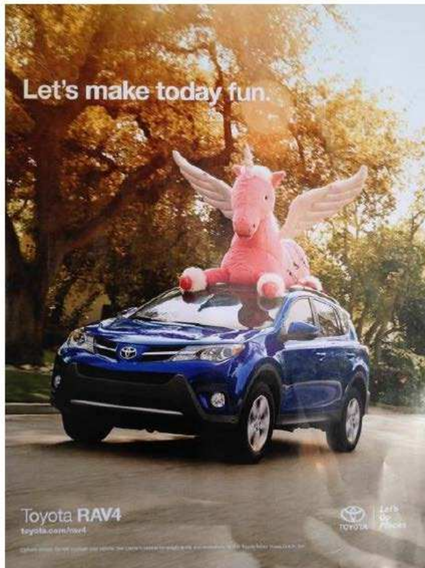
Compl., Ex. 5.

Toyota also used an image taken from the commercial to create a print advertisement. See Compl. ¶ 18. Toward the top of the print advertisement, the same slogan ("Let's make today fun.") appears in white letters. Plaintiff attaches the following reproduction of the print advertisement to his Complaint: