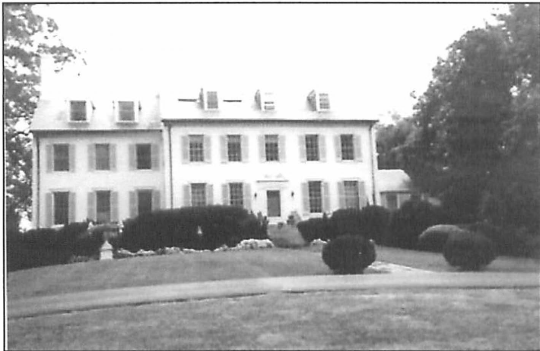
Id. (picture on page 104).

14. The Herrick book stated that the 1941 Memorandum “itemized personal property that would be left behind [following the sale of the property to Justice Jackson]. Included were such items as . . . [a] large lawn urn . . . .” [Doc. No. 53-13] at 6. Included in the Herrick Book on page 104 is the following photograph with the caption: “This is Hickory Hill as it looked in 2000 . . . . To the left is the yard urn that Justice Jackson requested be conveyed with the sale of the house.” [Doc. No. 53-13] at 7.