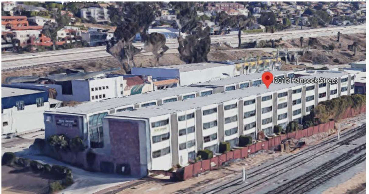
Save our Access v. City of San Diego 013228