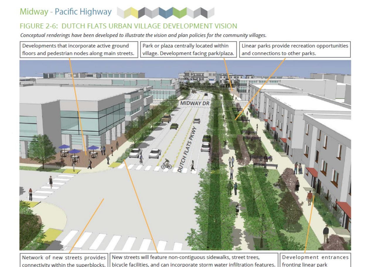
LU-32 Midway - Pacific Highway Community Plan