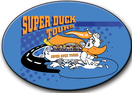
Super Duck's design mark