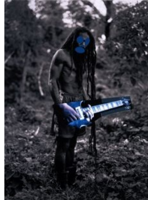
Richard Prince, Graduation

Between November 8 and December 20, 2008, the Gallery put on a show featuring twenty-two of Prince's Canal Zone artworks, and also published and sold an exhibition catalog from the show. The catalog included all of the Canal Zone artworks (including those not in the Gagosian show) except for one, as well as, among other things, photographs showing Yes Rasta photographs in Prince's studio. Prince never sought or received permission from Cariou to use his photographs.