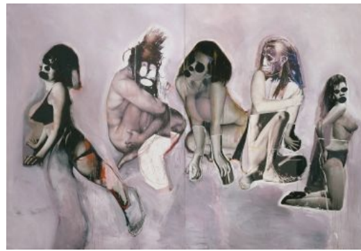
Richard Prince, James Brown Disco Ball