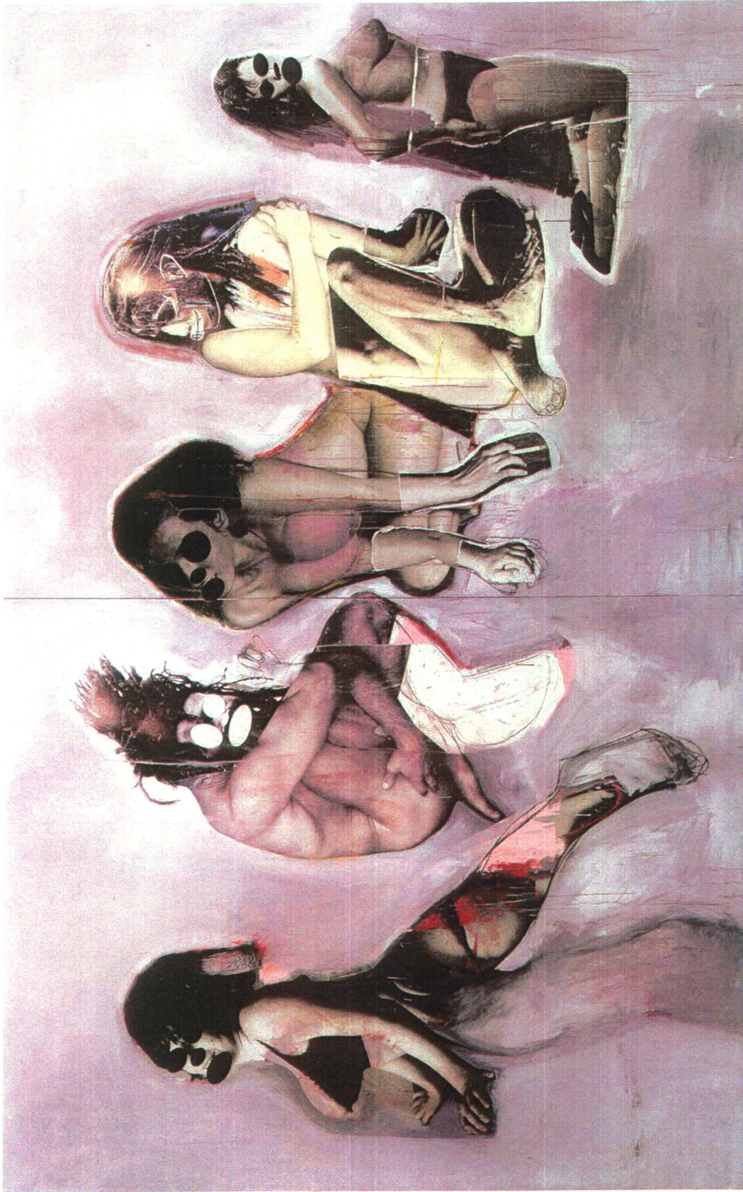
11 James Brown Disco Ball