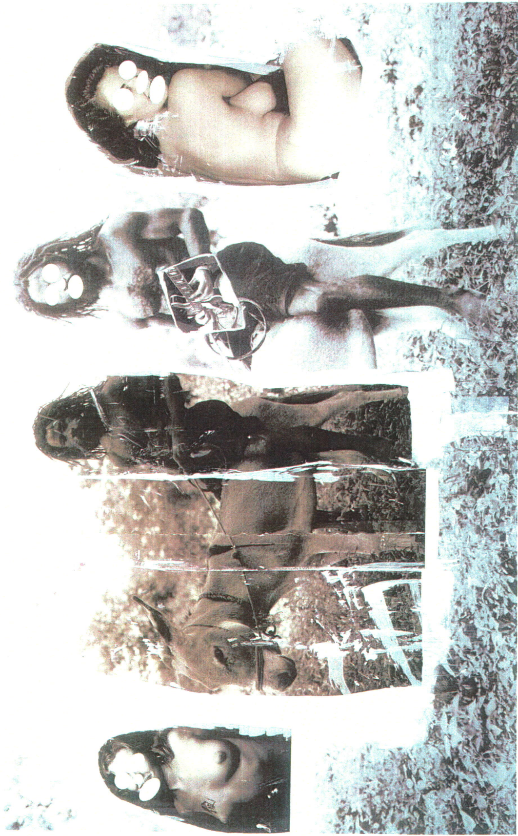
4 Back to the Garden