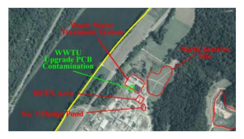
Figure 1: Partial Map of the Site (Dist. Ct. Dkt. No. 77-1 at 48)

Those processes created substantial PCB-laden chemical wastes. UCC disposed of that waste by burning it, or by depositing it into neutralization tanks or lime pits at the Site. After the lime pits filled with sludge, UCC drained them and dug them out, and used the PCB-laden sludge to backfill other areas of the Site. Some of the PCB-laden waste was deposited in the North Inactive Site, a 5.5 acre landfill located uphill and northwest of the Site's waste water treatment facility and a creek that runs through the Site, known as Sugar Camp Run. See Dist. Ct. Dkt. No. 77-1 at 48 (map of the Site); see also Dist. Ct. Dkt. No. 80-17 at 82–85 (ENVIRON Map of Site). The precise locations of all the backfill areas are unknown.