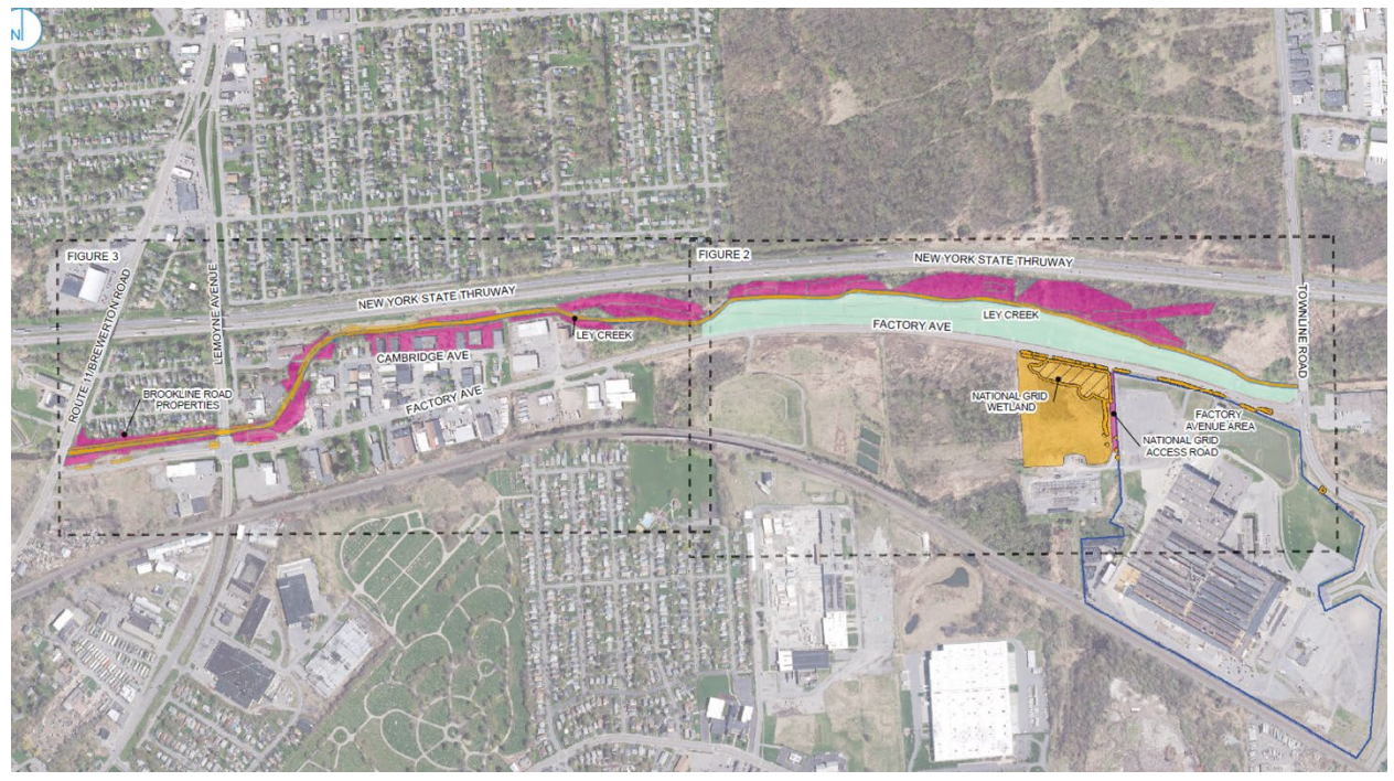
App'x 414. This map, created by RACER, provides a satellite overview of the land in question. The former IFG Plant, described as "OU-1," is outlined in dark blue. Ley Creek and the National Grid Wetland, and several small patches included within "OU-2" are highlighted in orange. The Ley Creek Dredgings Subsite, discussed below in note 5, is in aqua. Finally, the land that RACER describes as the "Expanded Territory" (discussed below) is in magenta. Defendants reject the characterization of the magenta area as a distinct "Expanded Territory."

Wetland"), soil within the "Factory Avenue Area" between OU-1's Northern property boundary and Factory Avenue, soil along the northern shoulder of Factory Avenue, and the National Grid/Teall Avenue Substation access road. Id.