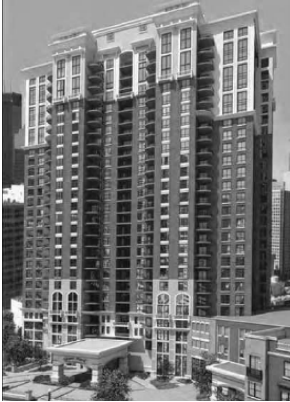
Two Park Crest Exterior: