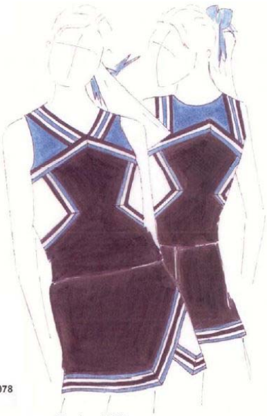
Design 078 Registration No. VA 1-417-427