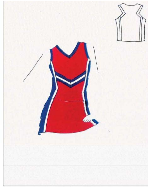
Design 0815 Registration No. VA 1-675-905