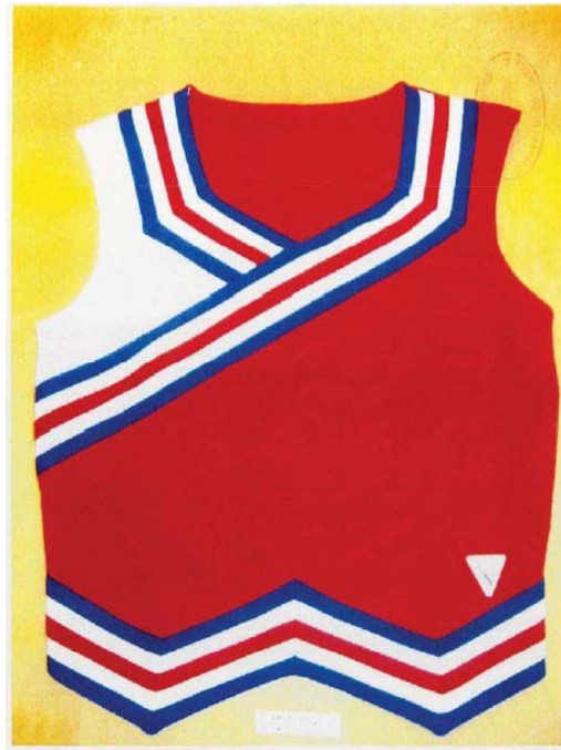
Design 299A Registration No. VA 1-319-228