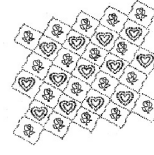
'776 and '830 patents