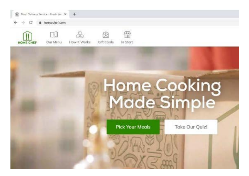
Home Chef Website

None of the images used in the survey exhibited the Home Chef Home Logo or the HC Home Mark in isolation without