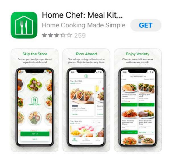
Home Chef Mobile App