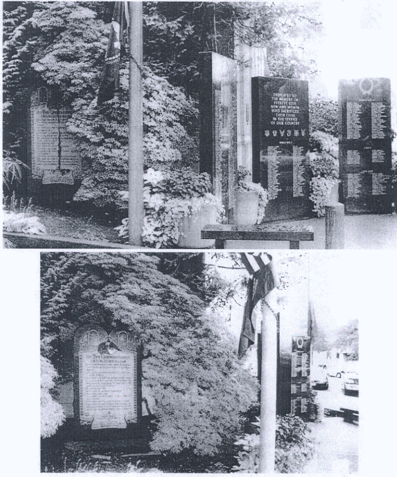
The Ten Commandments monument in Everett, Washington.