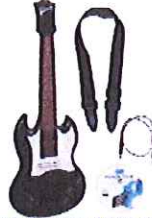
Hasbro Power 10ur Electric Guitar (Black)