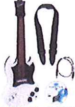
Power 10ur Guitar White