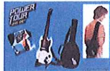
Power 10ur Big Set Display Stand and Carry Case