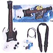
Power 10ur Electric Guitar - White