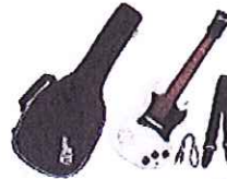
Power 10ur-Tiger Electric Guitar With Carrying Case, 1 Set