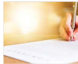
Words for Mistake