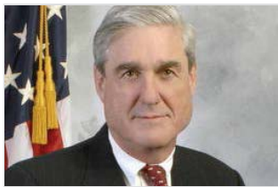
Trending: WSJ: Mueller 'Impanels' Grand Jury