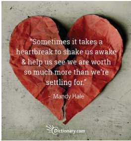
15 Writers on Heartbreak and...