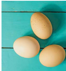
All in One Basket: 8 Eggcentric...

cited as Clifford V. Google, Inc. , No. 15-15809 archived on May 11, 2017