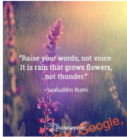
14 Quotes for Daily Inspiration