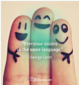
15 Powerful Quotes about Language