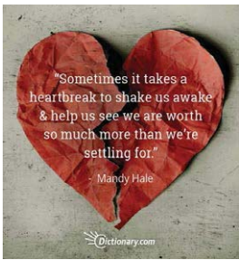
15 Writers on Heartbreak and...