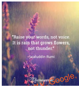
14 Quotes for Daily Inspiration