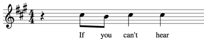
Theme X in "Blurred Lines"