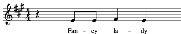
Theme X in "Got to Give It Up"

can't hear.” Like the Hook Phrase, Theme X is both unprotectable and objectively dissimilar in the two songs.