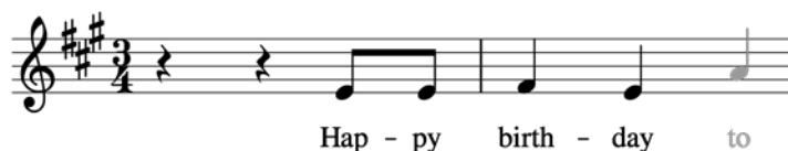
Theme X in "Happy Birthday to You"

The pitches and rhythm of Theme X in the deposit copy are identical to those sung to "Happy Birthday" and numerous other songs. None of the Theme X pitches in the deposit copy are the same as in "Blurred Lines." To see any correspondence between the two four-note sequences, one would have to shift and invert the pitches, a feat of musical gymnastics well beyond the skill of most listeners. Where short and distinct musical phrases require such contortions just to show that they are musically related, there is no basis to find them substantially similar. See Johnson , 409 F.3d at 22; see also Arnstein , 82 F.2d at 277.