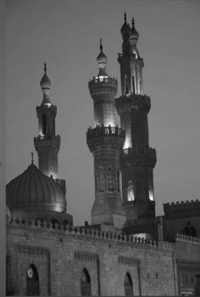
POS120 – Islamic Terrorism