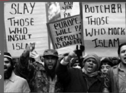
Pro-Islamic terror rally in London.