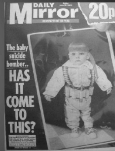
Future Hamas suicide bomber?