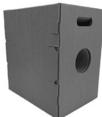
Application Serial No. 87285412 (the '412 trade dress)

The '383 trade dress includes the following description: