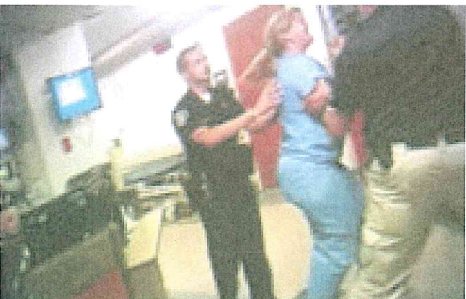
Nurse Who Was Forcibly Arrested For Protecting Patient Gets $500K Settlement