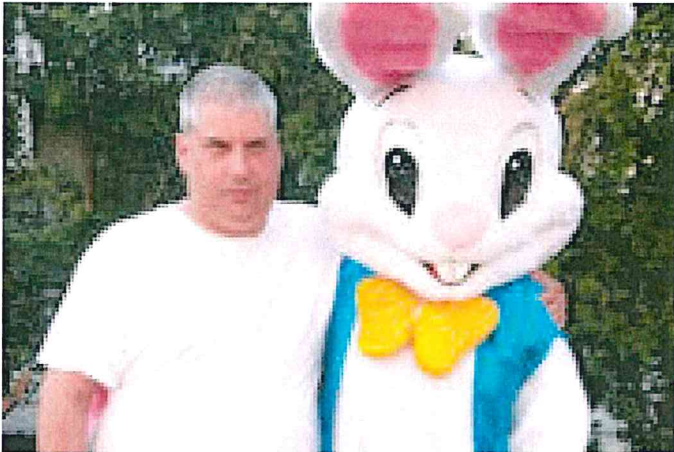
Man Who Dressed As SpongeBob SquarePants For Children's Parties Accused Of Sexual Assault