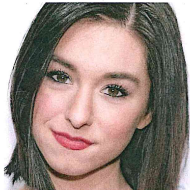
Celebrities Who Were Murdered by Their Fans GRUNGE.COM