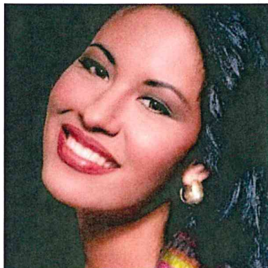
The Untold Truth of Selena's Death NICKISWIFT.COM