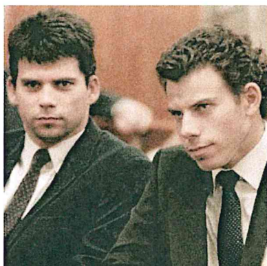
Whatever Happened to America's Most Infamous Alleged Criminals? NICKISWIFT.COM