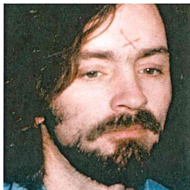
What the Members of the Manson Family Are Doing Now NICKISWIFT.COM