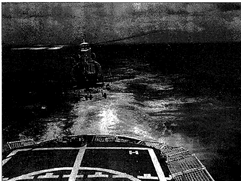
GULF OF MEXICO - A Coast Guard HH-65C Dolphin helicopter lands on the Coast Guard Cutter Resolute while work continues at the Deepwater Horizon spill site as part of the largest oil spill response in history, July 4, 2010.

> View More Photos | Flickr | CG Visual Imagery