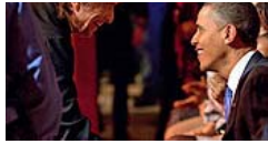
Audio Excerpts: Obama on Dylan and McCartney at the White House