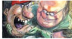
Matt Taibbi: The Truth About the Tea Party