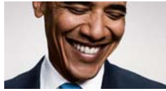
Interview: After the Primaries by Jann S. Wenner (July 2008)

The recovery package we shaped was put together on the theory that we shouldn't exclude any ideas on the basis of ideological predispositions, and so a third of the Recovery Act were tax cuts. Now, they happened to be the most progressive tax cuts in history, very much geared toward middle-class families. There was not only a fairness rationale to that, but also an economic rationale — those were the folks who were most likely to spend the money and, hence, prop up demand at a time when the economy was really freezing up.