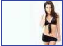
200 x 150 - 6k - jpg www.freewarefiles.com

Showing only similar images - Back to results for "Amy Weber"