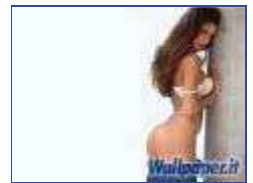
300 x 225 - 7k - jpg www.wallpaper.it Similar images