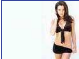
400 x 300 - 21k - jpg www.winsoftware.de Similar images