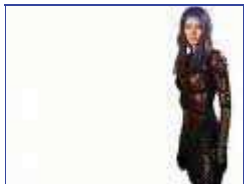
320 x 240 - 7k - jpg bp3.blogger.com Similar images