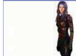
320 x 240 - 7k - jpg bp3.blogger.com Similar images