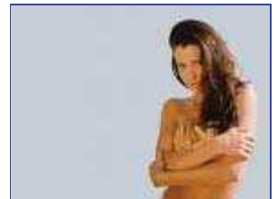
800 x 600 - 51k - jpg www.tonguide.com Similar images