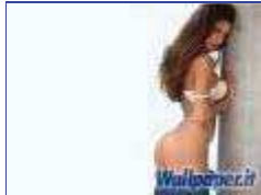
300 x 225 - 7k - jpg www.wallpaper.it Similar images