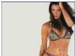
320 x 240 - 9k - jpg bp0.blogger.com Similar images