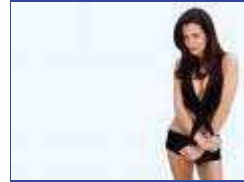
320 x 240 - 7k - jpg bp3.blogger.com Similar images