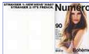
936 x 542 - 51k - jpg fashionverbatim.net Similar images