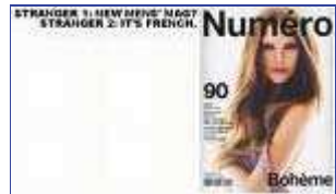
936 x 542 - 51k - jpg fashionverbatim.net Similar images