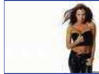
150 x 113 - 7k - jpg www.yeuanhso.com Similar images