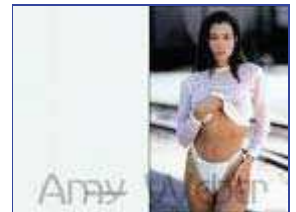
640 x 480 - 22k - jpg www.studiofaca.com