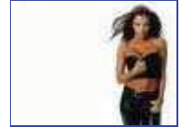
130 x 98 - 1k - jpg www.shareapic.net Similar images