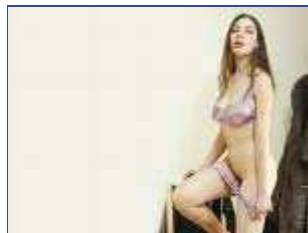
1024 x 768 - 45k - jpg www.wallpapy.cz Similar images