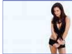
320 x 240 - 7k - jpg bp3.blogger.com Similar images