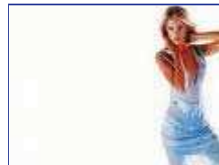
320 x 240 - 7k - jpg bp1.blogger.com Similar images