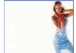
320 x 240 - 7k - jpg bp1.blogger.com Similar images