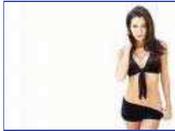
400 x 300 - 10k - jpg bp0.blogger.com Similar images