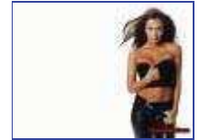
170 x 128 - 5k - jpg www.maximumwall.com Similar images