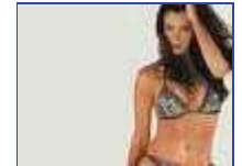
157 x 118 - 10k - jpg www.actupeople.fr Similar images