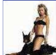
120 x 120 - 3k - jpg gal.neogen.ro Similar images