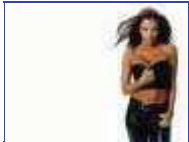
130 x 98 - 1k - jpg www.sharepic.net Similar images