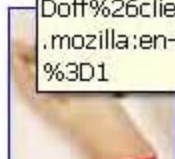
PERFECT10 com - The World s Most ... 99 x 150 - 4k - jpg darkshadow.3xforum.ro