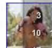
PERFECT10 com - The World s Most ... 99 x 150 - 5k - jpg