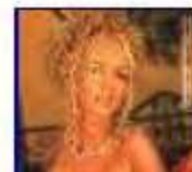
PERFECT10 com - The World s Most ... 99 x 150 - 6k - jpg darkshadow.3xforum.ro