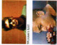
Chris Brown loses three Grammy nominations