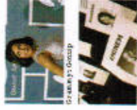
Fire Blow Live Blog