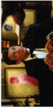
Hollywood Backlot - James Franco