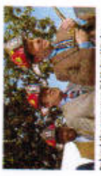
Behind-the-scenes on Ed Harris' 'Cedar Rapids'