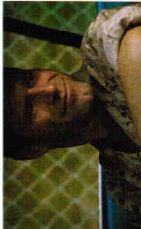
Aaron Eckhart on the set of "Battle: Los Angeles"