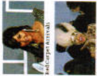
Red Carpet Arrivals

Entertainment Blogs Entertainment Blogs Entertainment Blogs