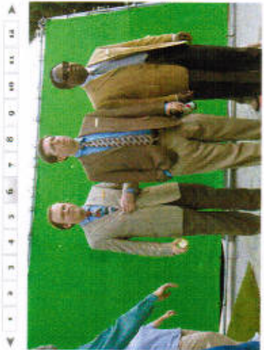
Cedar Rapids John C. Reilly, Ed Helms and Tim Allen in 'Cedar Rapids'