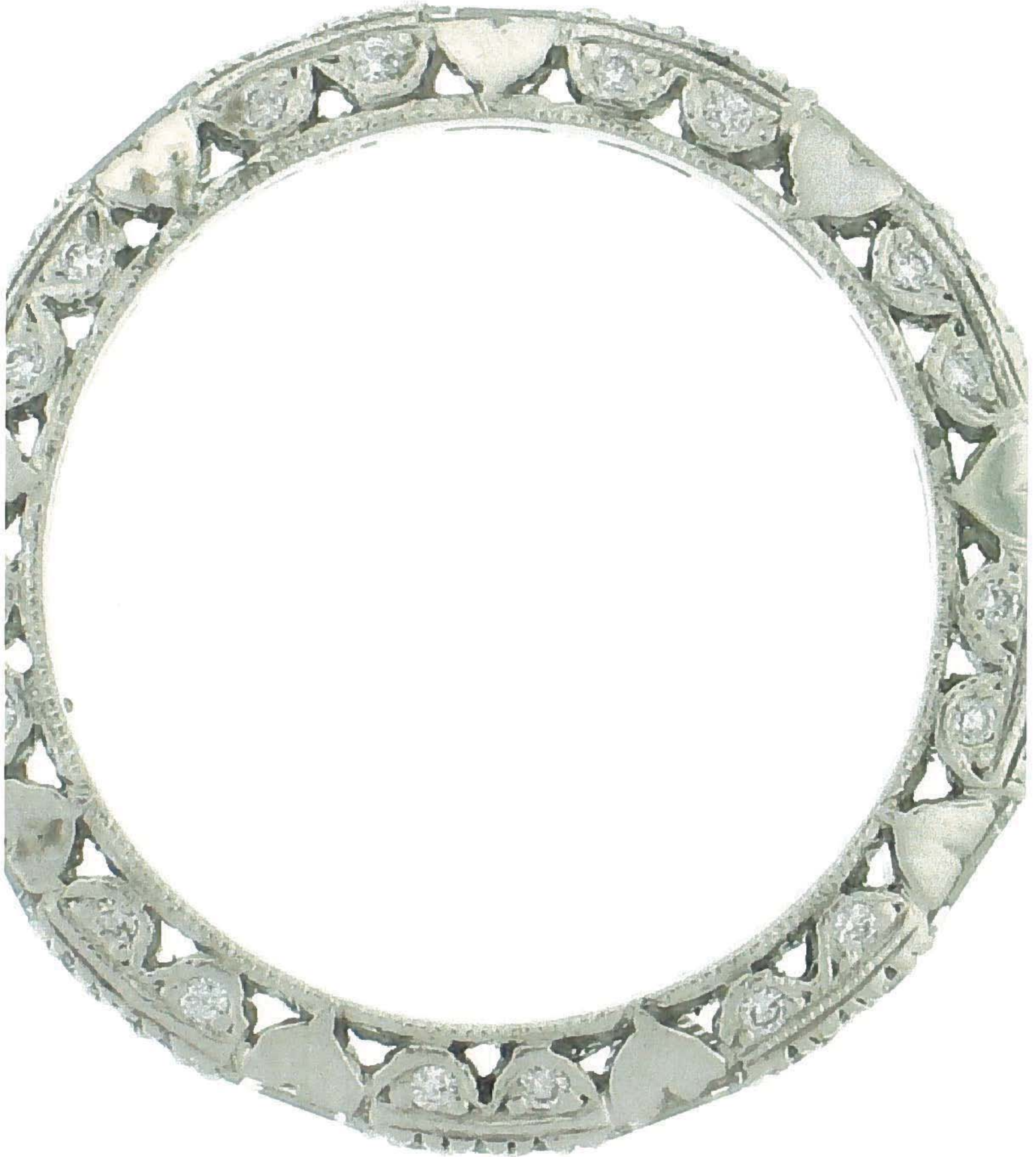
HT 2425 B Exhibit A Page 723