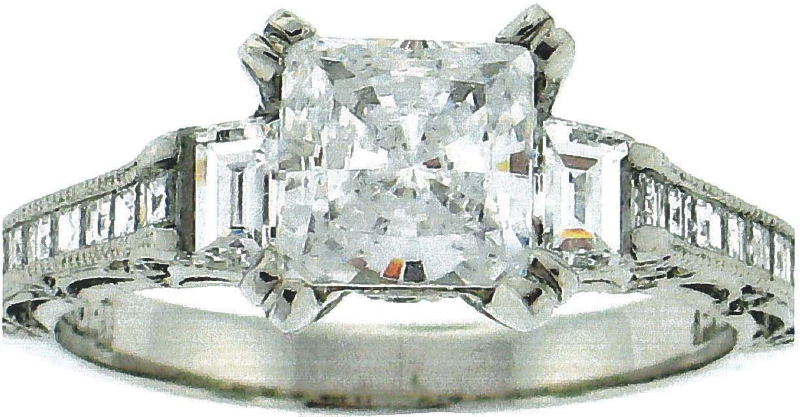
HT 2509 PR