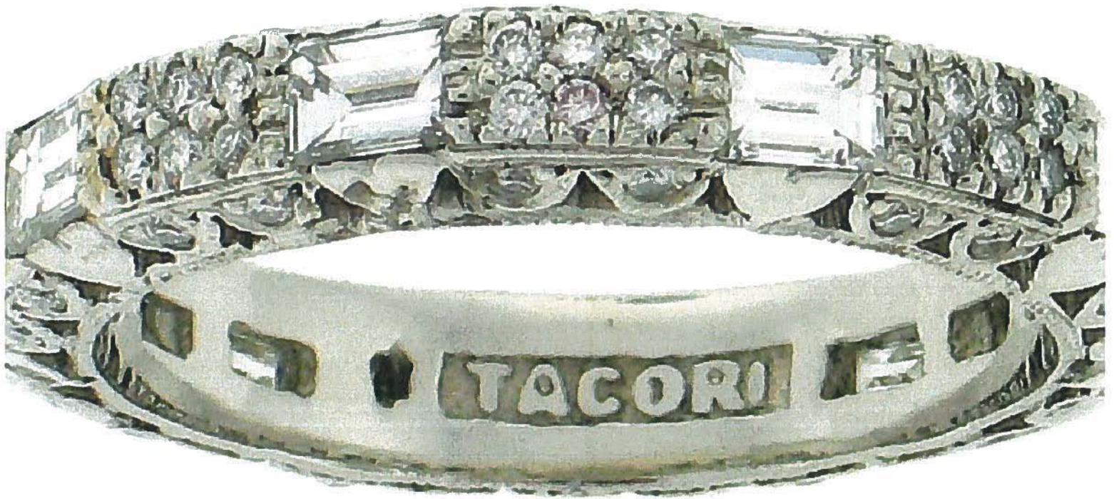
HT 2425 B