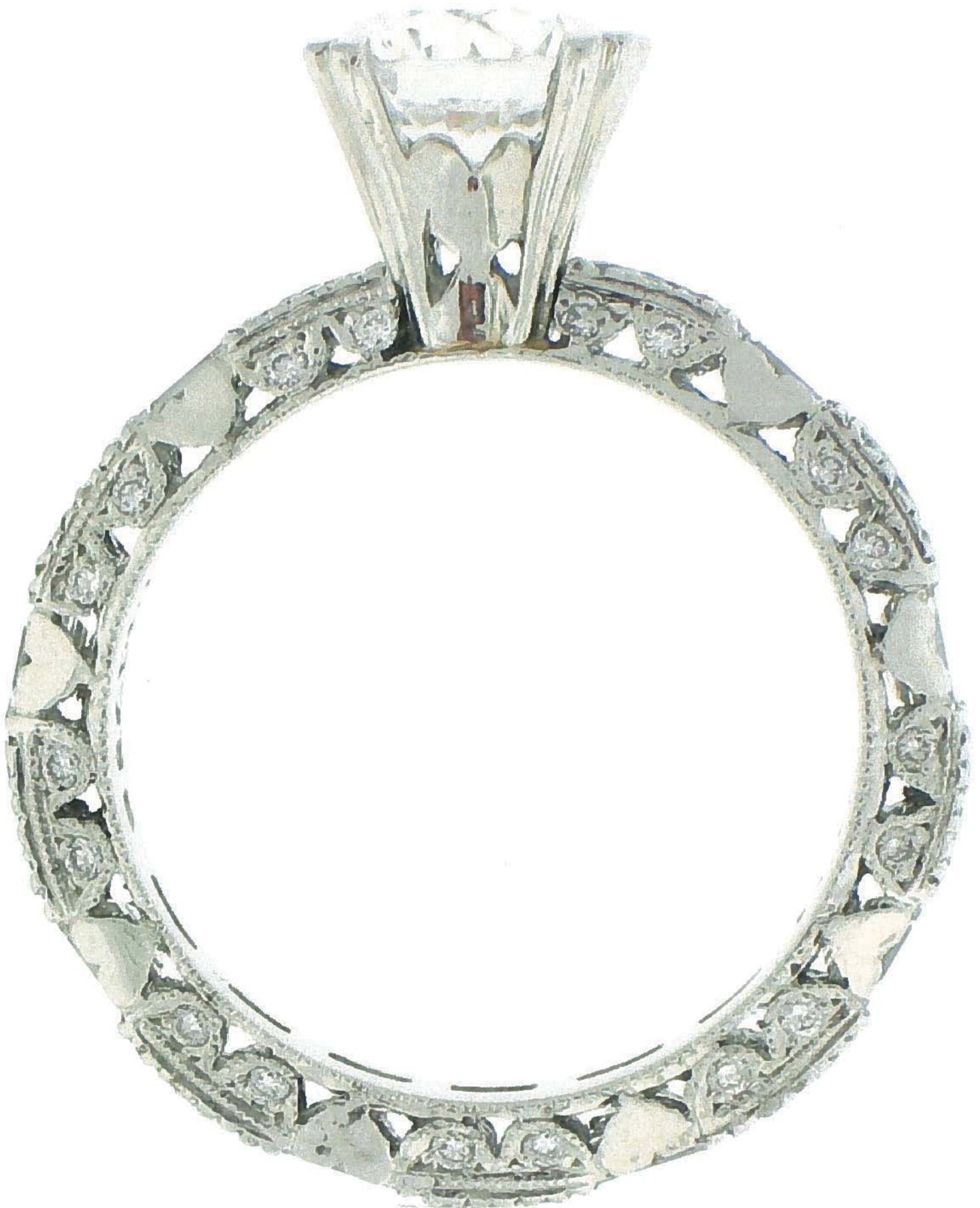
HT 2425 Exhibit A Page 729