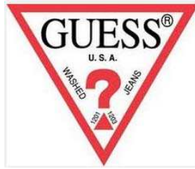
Guess Triangle Trademark

9. Defendants further agree that the following United States Trademark Registration's ("Guess' Trademarks") are owned by Guess and are valid and enforceable: