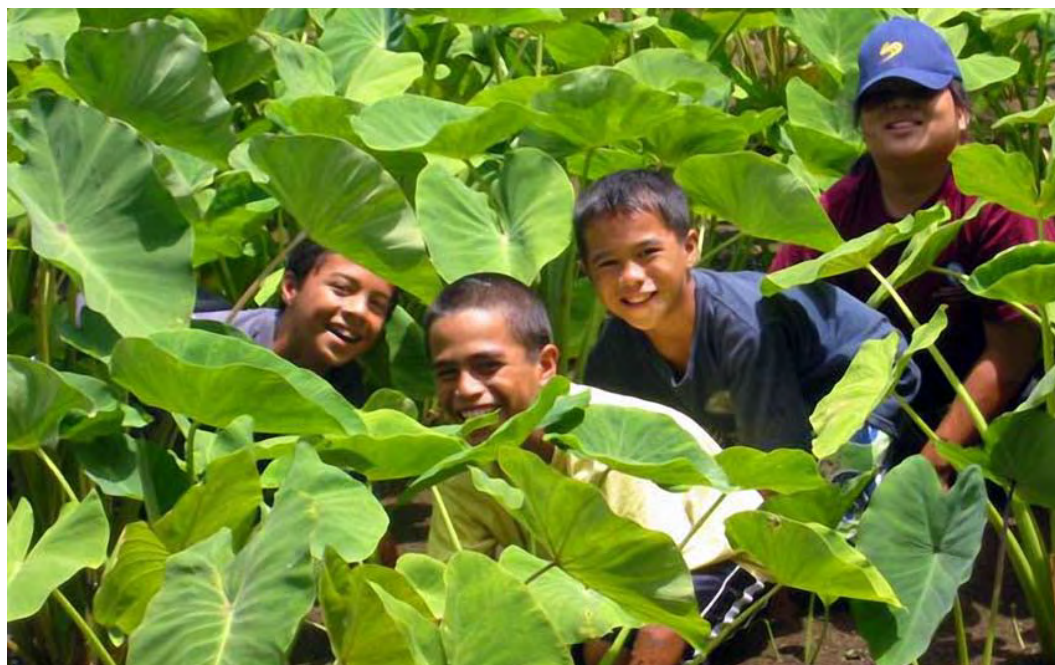
Kamehameha's 'Āina Ulu land-based educational program bridges the management of Kamehameha's lands with its educational mission.