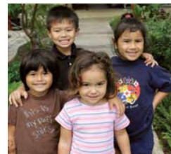
Kamehameha provided $4.4 million to 850 keiki in community preschools through its Pauahi Keiki Scholars program.

For more on Kamehameha's educational efforts, please visit the Community Education Implementation division's Web site at ( http://extension.ksbe.edu/content/ ).