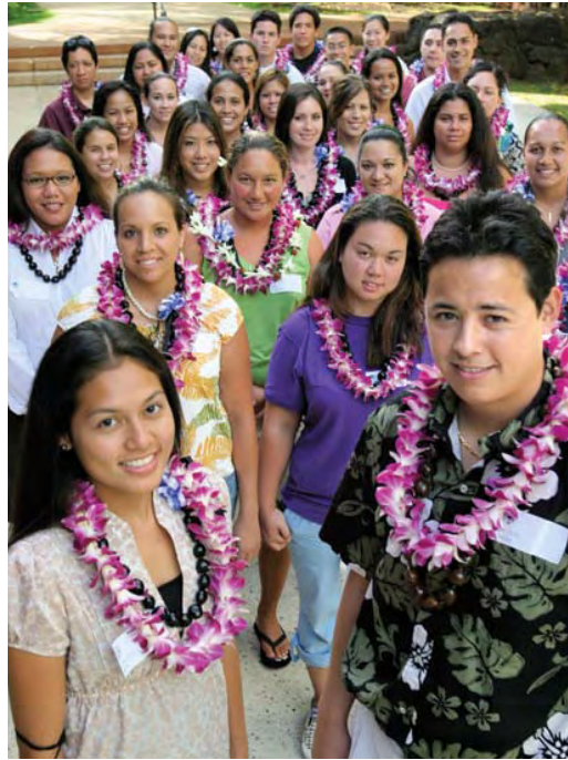
Kamehameha Schools awarded $16.4 million in post-high scholarships to 2,200 students.

In fact, fiscal year 2007 saw Kamehameha Schools invest more than