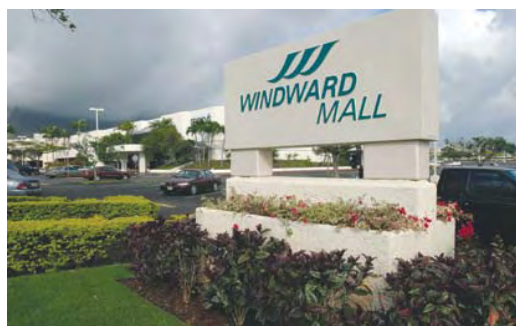
Windward Mall was revitalized with a $23 million renovation.