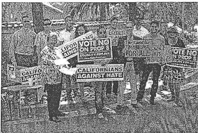
Members of Californians Against Hate outside the home of [redacted] during a peaceful demonstration last weekend.

About two-dozen protesters held up signs and greeted at least 150 guests arriving at [redacted] attorney [redacted] home Saturday, August 16 for a $100-a-head pro-Prop 8 fundraiser.