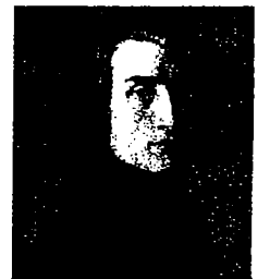
Franz Liszt detail from an 1838 portrait by Henri Lehmann (1814–1882)