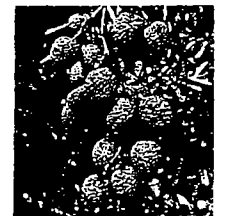
litchi Litchi chinensis