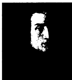
Franz Liszt detail from an 1838 portrait by Henri Lehmann (1814–1882)