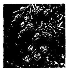
litchi Litchi chinensis