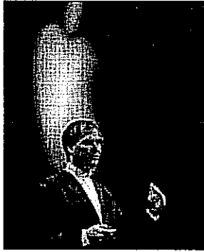
Steve Jobs: "Quantum leap in listening"

It shrinks bulky music files down to about a twelfth of their original size by only recording the sounds you can hear.