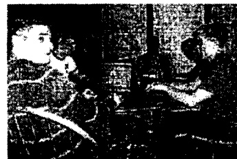
Zuckerberg (back, head of table) and his team of programmers, including Dustin A. Moskovitz '06-'07 (left), do their business casually at the

In just five months, what began as a follow-up project to Zuckerberg's failed HotOrNot.com spin-off, Facemash.com, became an internet