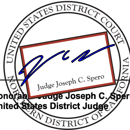
Honorable Judge Joseph C. Spero United States District Judge