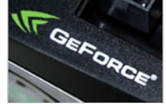
Gigabyte GeForce GTX 570 (1280MB) Review