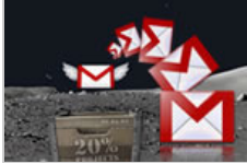
Tool Up! Regain Control of your Gmail Inbox