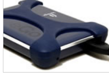
Iomega eGo 1TB USB 3.0 Portable Hard Drive Review