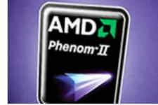
AMD Phenom II X6 1100T Black Edition CPU Review