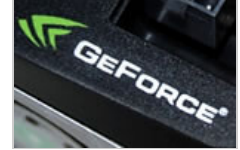
Gigabyte GeForce GTX 570 (1280MB) Review