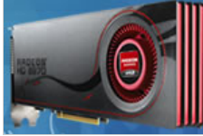
AMD Radeon HD 6970 Review