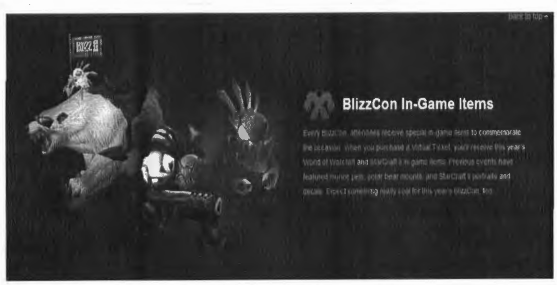
27 Figure 3. On-line advertisement for the 2011 BlizzCon featuring baby murlocs.

10 20. Since at least November 2005, baby murloc pets employing Ms. Lewis' 11 voice and derivatives thereof have been awarded to BlizzCon attendees as part of 12 Blizzard's marketing and branding strategy. Blizzard has also provided unique baby 13 murloc pets to participants of other WoW-related activities, such as player vs player 14 Arena Tournaments. Blizzard even sells "plush" baby murlocs in its online store. In 15 short, due in significant part to the appeal of Ms. Lewis' creative and vocal work, baby 16 murlocs have become the de facto mascot of the billion dollar enterprise that is WoW.