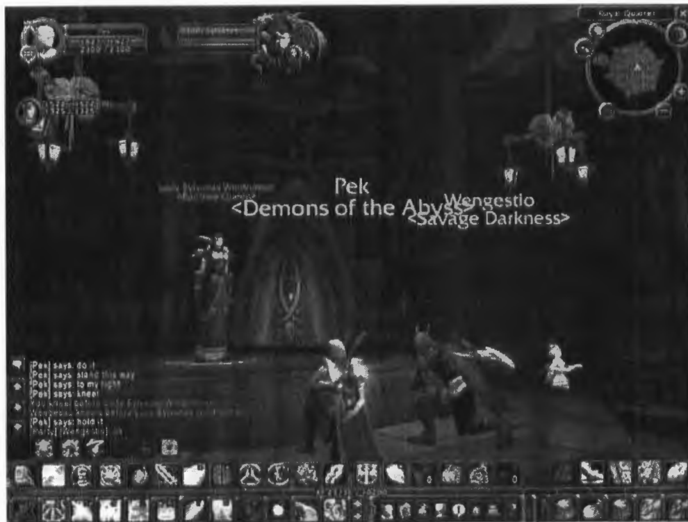
Figure 1. World of Warcraft screenshot.

12 15. Once players reach the maximum level, they can participate in additional 13 game activities, such as multi-player raids, level-restricted dungeons, and player vs 14 player arena matches and battlegrounds. Figure 1 is a "screenshot" from WoW.