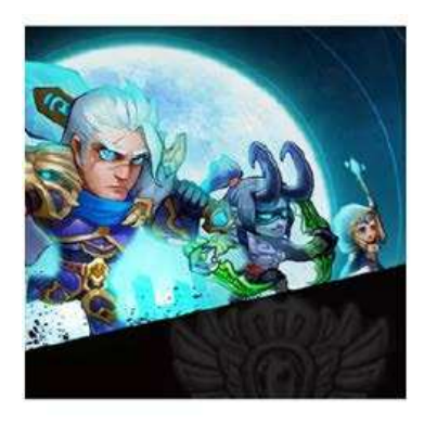
Facebook ad for Soul Hunters

Lilith argues that these "comparison[s] of bare images" are not enough because they fail to detail the protected elements of each character and compare them specifically to those in Soul Hunters. See Lilith's MTD at 9–14; Lilith's Reply (dkt. 237) at 8–9. But Lilith's proposed standard is not the pleading standard. Rule 8 requires not "detailed factual allegations" but rather only enough factual matter to show that a claim is "plausible on its face" and to give the defendant "fair notice." Twombly, 550 U.S. at 555, 570. Here, with respect to most of Plaintiffs' games, Lilith cannot reasonably argue that the SAC and its exhibits fail to provide fair notice or enough factual matter showing that Plaintiffs' claims are plausible on their face. In particular, the SAC and its exhibits allege several representative examples of Soul Hunters infringing the Warcraft games, DotA, and Dota 2. See SAC Exs. A and B. And though Lilith suggests that Plaintiffs provide no specific allegations of Soul Hunters infringing Hearthstone and Heroes of the Storm, see Lilith's MTD at 8, Plaintiffs in fact do provide representative examples of infringement with respect to both games. See SAC Ex. A at 4 and 9.