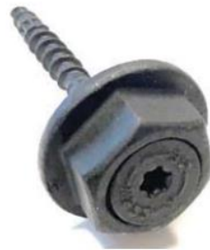
21 22 23 24 25 26 27 The Accused Products 6