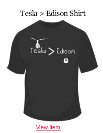
View more Oatmeal goodies here.